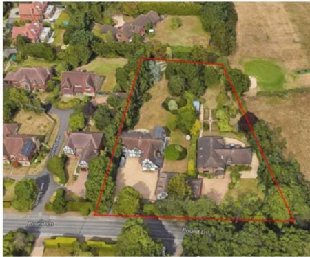
Figure 8: Scale of existing development in the surrounding area